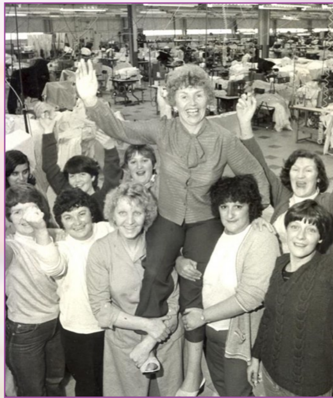
“Sitting Tight” Screening.