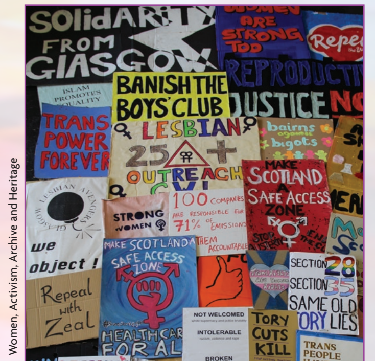
Women, Activism, Archive and Heritage