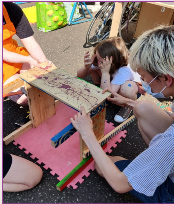
Rumpus Summer Yard Club

We'll introduce the fascinating world of paper marbling. Learn different design patterns, explore vibrant colours, and try your hand at this wildly approachable technique. We'll also provide collage materials, encouraging you to craft meaningful sentences and poetic messages on your marbled paper. Don't miss out on this wonderful opportunity for artistic expression and community building. Join us at GZL for a memorable Saturday!