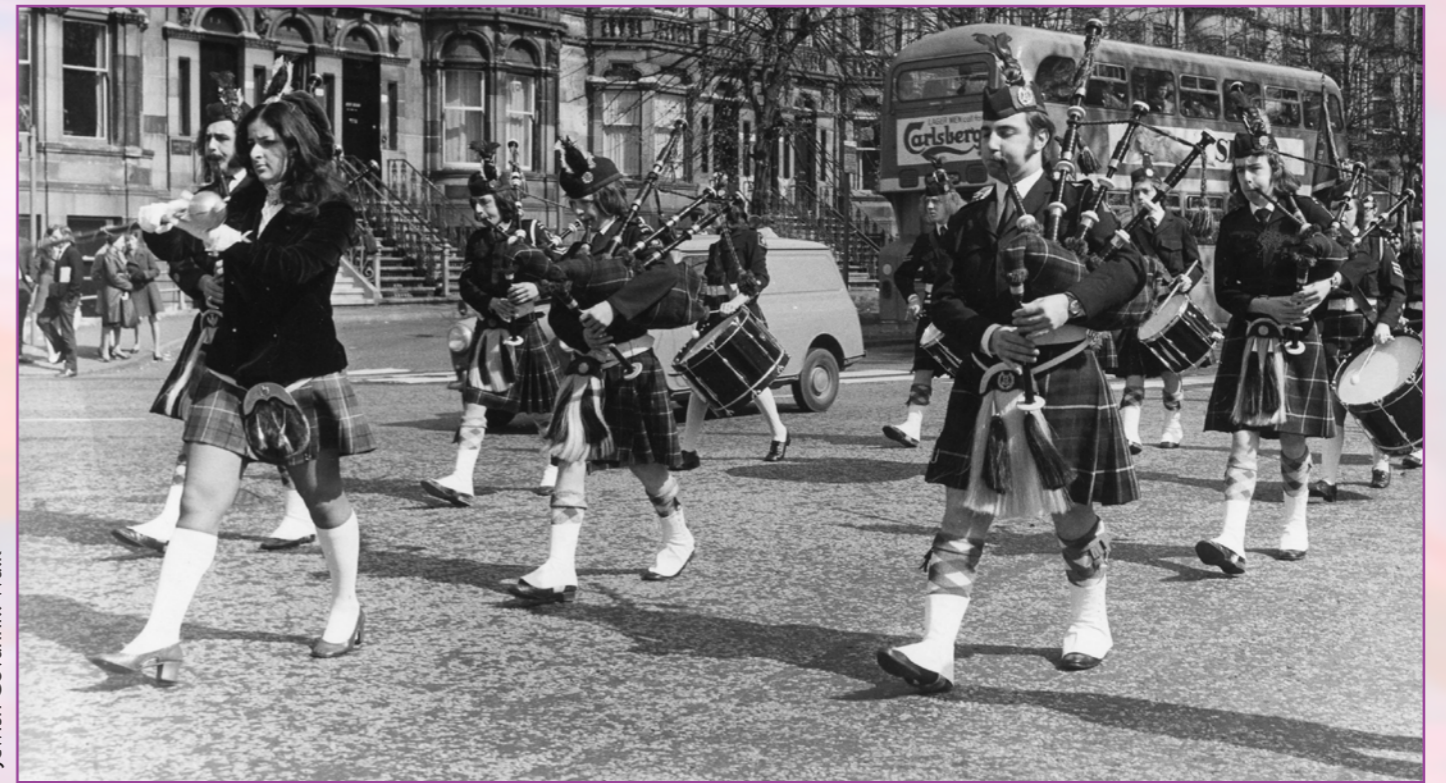
Jewish Govanhill Walk

Contact Dave Zabiega to sign up. at: dzabiega@govanhillha.org / 0141 636 3665