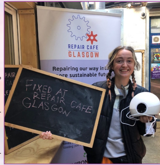
Repair Cafe with Repair Cafe Glasgow

both people and the planet and to take practical steps to do something about it. These events help to change attitudes by presenting an innovative approach to waste reduction, social cohesion and the transference of craft skills, through the act of repairing, upgrading and maintaining a broad range of products.