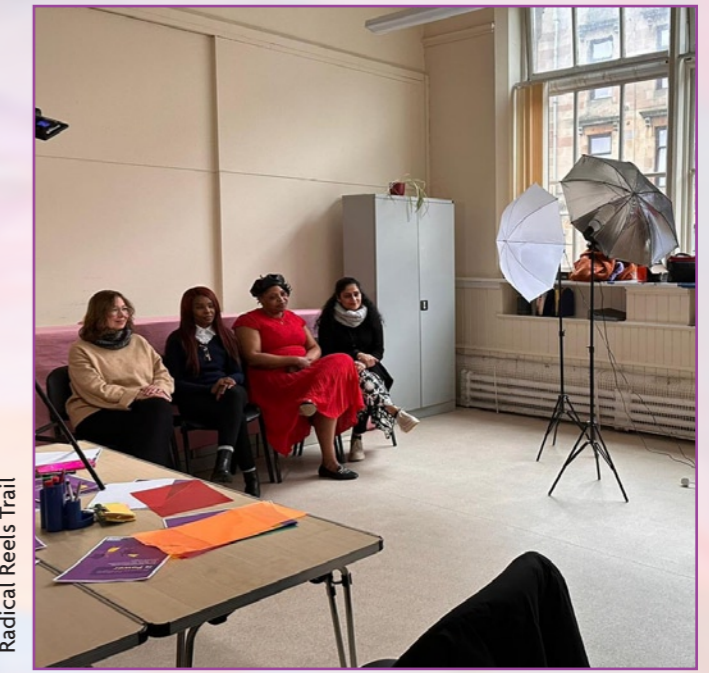
Radical Reels Trail

The most sustainable items of clothing are the items you already have in your wardrobe. Have you got a favourite pair of jeans, a jumper with a hole in it or a bag looking a bit worse for wear? In this practical workshop, bring your broken clothing items and our team will teach you the skills to repair your own items!